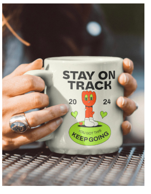
EAST OF MAY STUDIOS